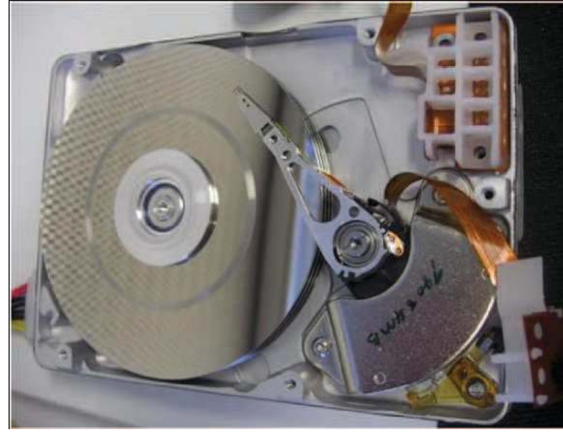
Fig 3.2: The dull ring near the middle diameter of this spinning disk is the result of a head crash.

For flyable media, the most cost-effective way to spin the disk is with its original motor and base casting or with from of a donor drive. All that is required is a standard HDD motor controller and related programming capability.[2] Once a compatible head stack is in place and the disks are spinning, the signal from the preamp needs to be acquired and used: first for servo positioning and then for data detection. To acquire a good signal, the read bias currents must be approximated for each head.[1]