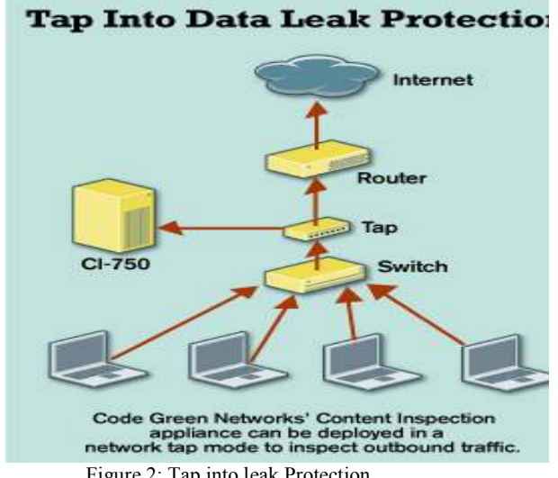
Figure 2: Tap into leak Protection